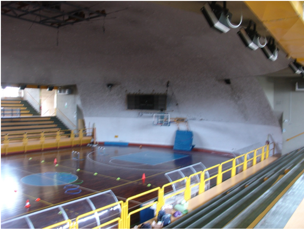
San Marcellino swimming pool (inside camp)