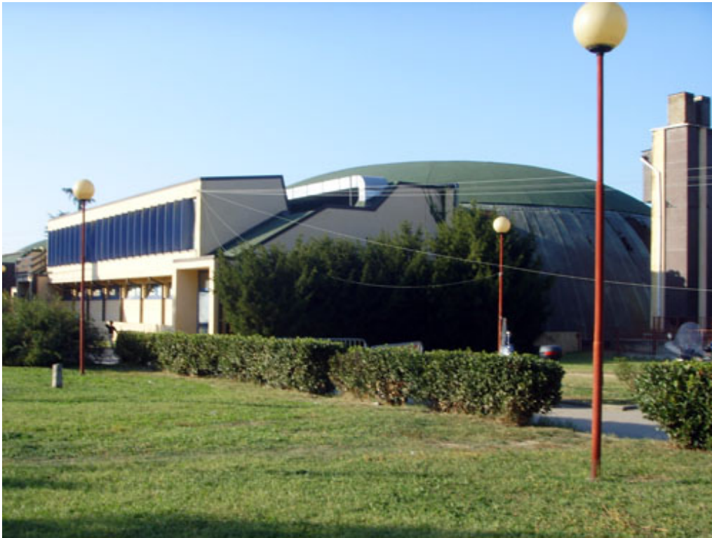
San Marcellino swimming pool (external)