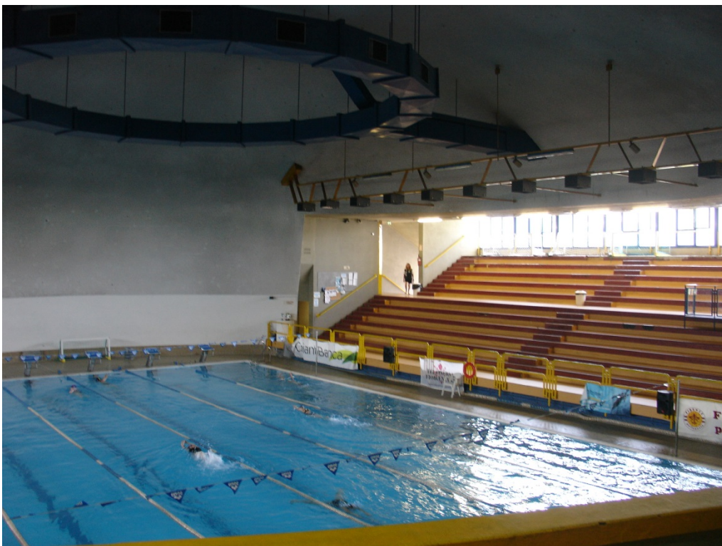
San Marcellino swimming pool (inside pool)