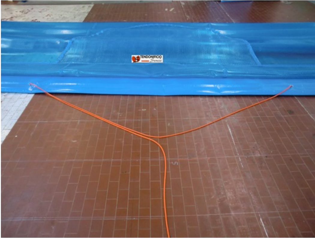
Pool thermal cover